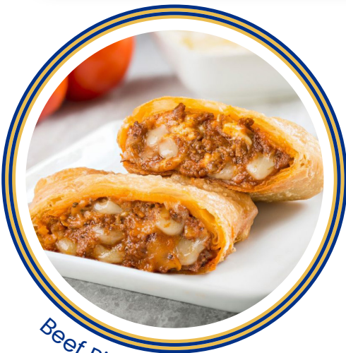
Beef Pizza Pie