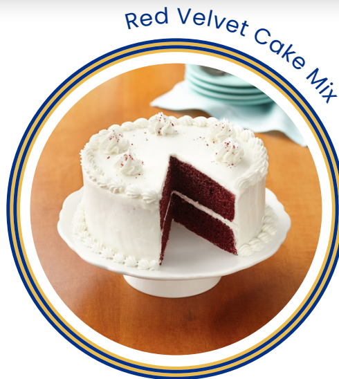
Red Velvet Cake Mix