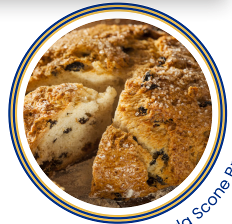
Irish Soda Scone Bread Mix