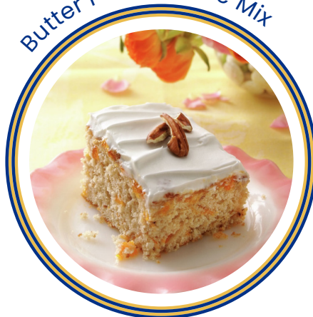
Butter Pecan Cake Mix