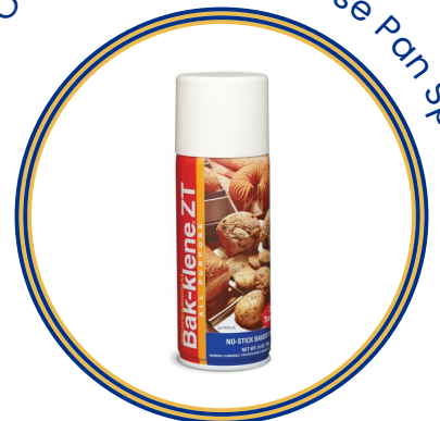
All Purpose Pan Spray