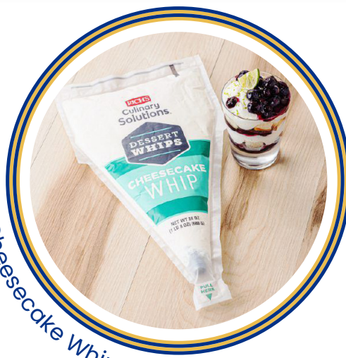
Cheesecake Whip Topping