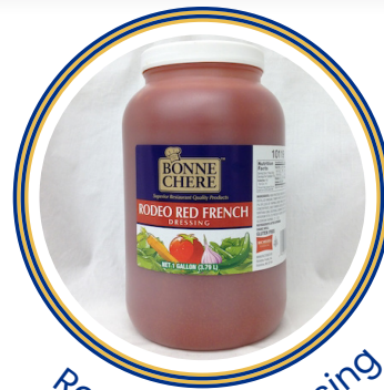
Rodeo Red Dressing