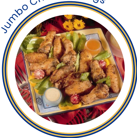
Jumbo Chicken Wings