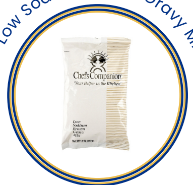
Low Sodium Brown Gravy Mix